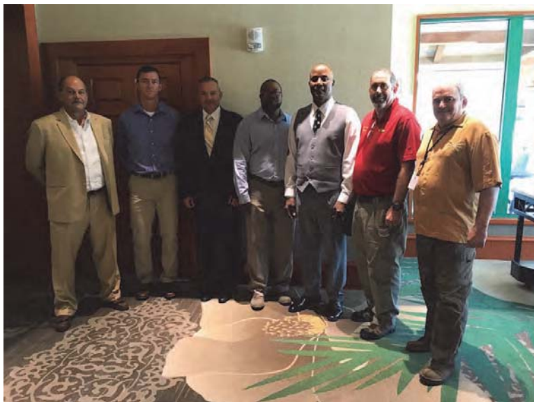
the EURAFSWA ESOs at 2017 DoN/NOSSA Explosives Safety Workshop Shades of Green in Orlando Florida