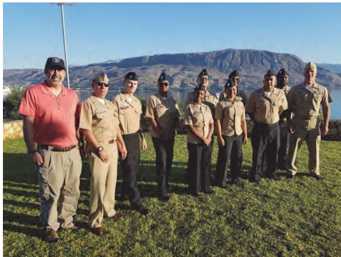
NMC Souda Bay

Check us out on Facebook..... "The Red Shirt"