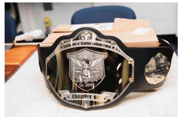
AOA-69 Captain's Cup event Champion's Belt.