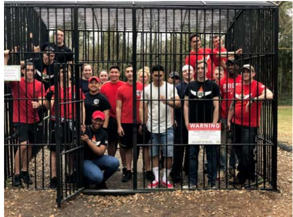
Chapter 69 Ordies at the Norfolk Zoo clean-up event