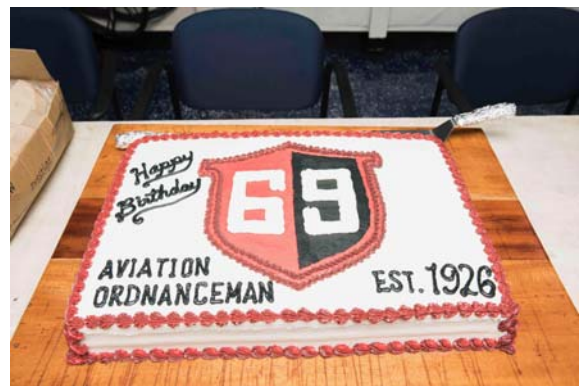
Happy 92nd Birthday AO2! ~IYAOYAS~