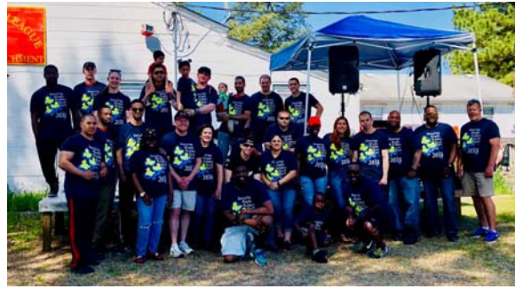
Chapter 69 and Chapter 4 Sailors at the CHIP Duck Race.